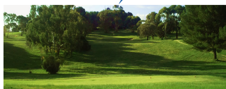
Lake Albert Golf Club